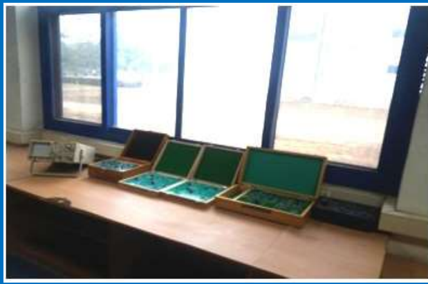
Analog & Digital Communication systems Lab